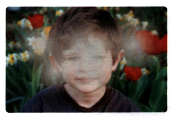
Blurry or dim vision