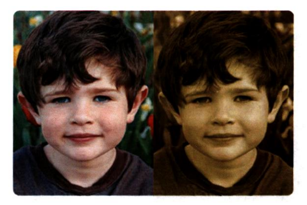
Left, normal vision. At right, dull or yellow vision.