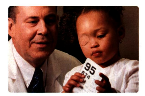
Patching a child's strong eye helps to strengthen the weaker eye.