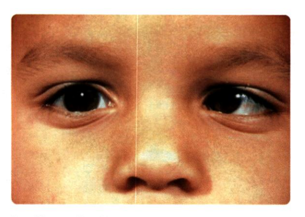
Strabismus is when the eyes are not lined up properly. Notice that light reflects in different places in both eyes.

Strabismus affects vision, since both eyes must aim at the same spot together to see properly. If someone's eyes are lined up properly during childhood, vision should develop well. But if the eyes are not aligned, a condition called amblyopia can develop. This is when the misaligned eye has weaker vision.