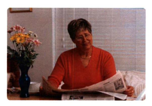
With presbyopia, reading glasses can help refract (bend) light rays before they enter the eye to compensate for loss of near vision.