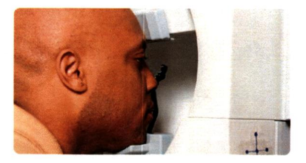
Visual field testing is used to monitor peripheral, or side, vision