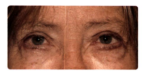
Blepharoplasty removes excess eyelid skin, improving appearance and vision.