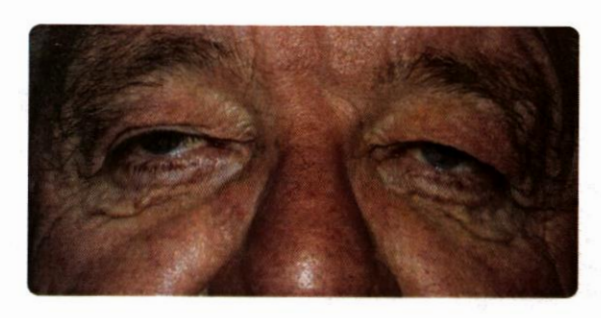
With ptosis, the upper eyelid droops.

Ptosis can also develop later in adult life. It sometimes begins after having other types of eye surgery or eyelid swelling.