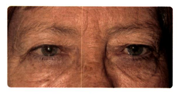
Too much eyelid skin can feel heavy and limit vision.

Ophthalmologists can remove excess eyelid skin in a procedure called blepharoplasty. At the same time, the surgeon may also remove extra fatty tissue near the eyelid or tighten muscles and tissue. This surgery helps make the area around the eye and lid look more clearly defined. It also makes eyes appear less tired and more alert.