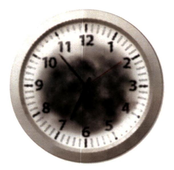
With AMD, dark areas may appear in your central vision.

AMD is very common. It is a leading cause of vision loss in people 50 years or older.